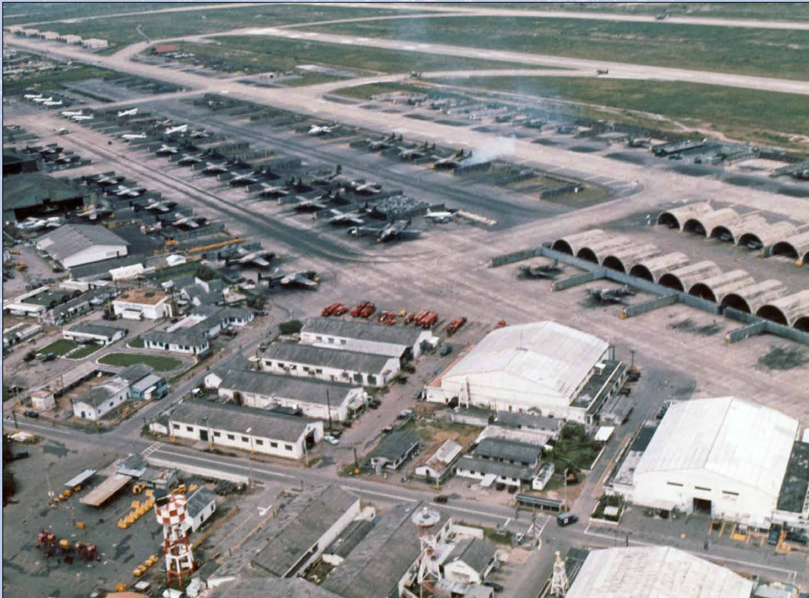
Aerial view of Tan Son Nhut Air Base in Vietnam. The North Vietnamese Army and Viet Cong considered U.S. air bases ideal targets to attack using mortars, rockets, and recoilless rifles.

It is easier and more effective to destroy the enemy's aerial power by destroying his nests and eggs on the ground than to hunt his flying birds in the air.