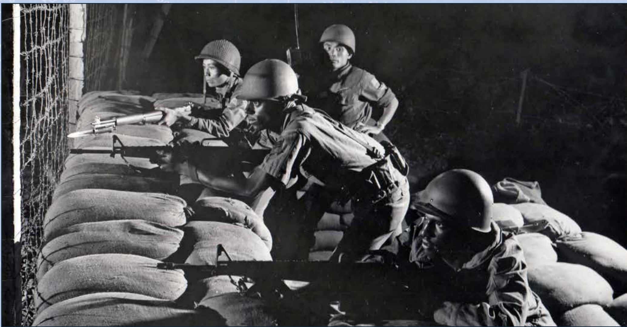
Members of the 6250th Air Police Squadron and Vietnamese soldiers guard the perimeter of Tan Son Nhut Air Base from inside a sandbag bunker.