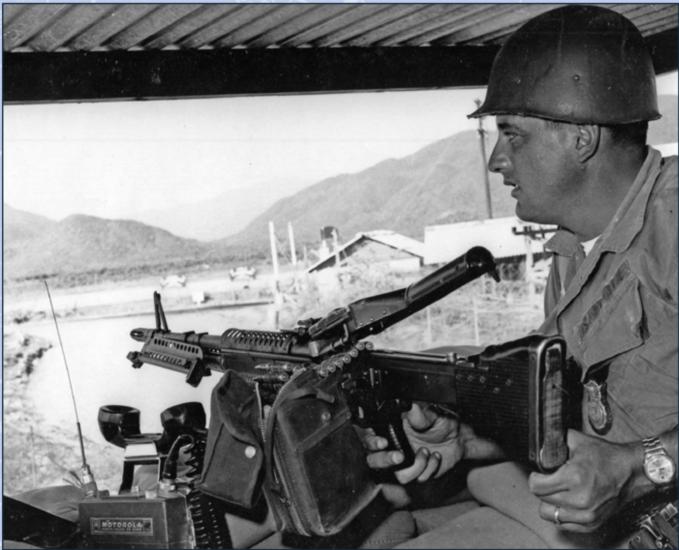
A U.S. Air Force military policeman peers out over "mortar valley" to the southwest of Nha Trang Air Base, with his M-60 machine gun at the ready.