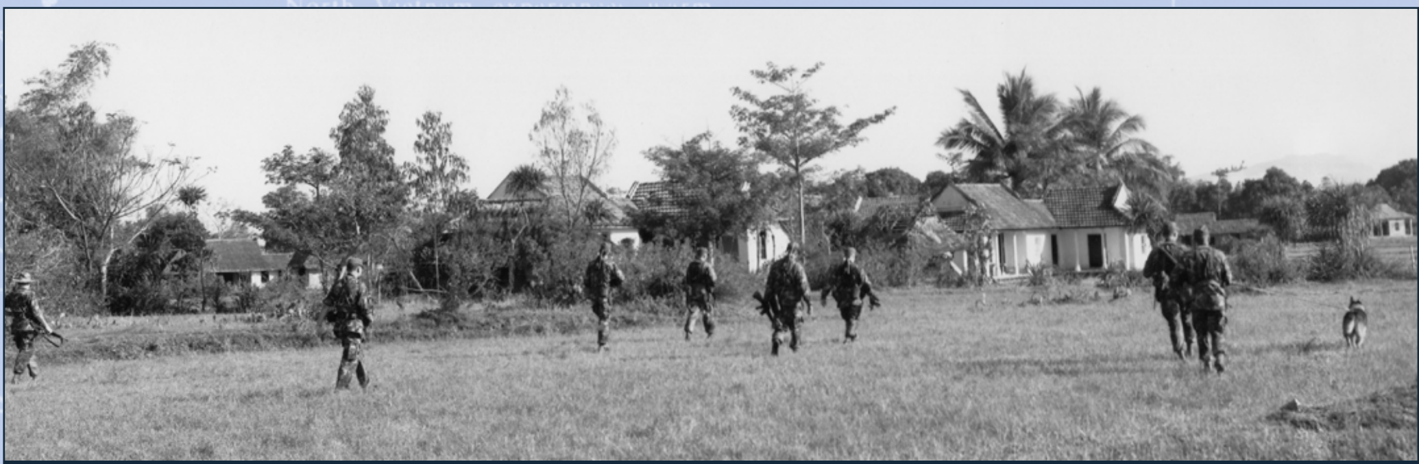
An early morning patrol passes through an abandoned village on Phu Cat Air Base.

This is Blue-3. I think that this rocket attack is cover for a ground attack, so take cover from the rockets but poke your heads out every few seconds. If you see any VC, make'em 10-13 (radio code for dead).