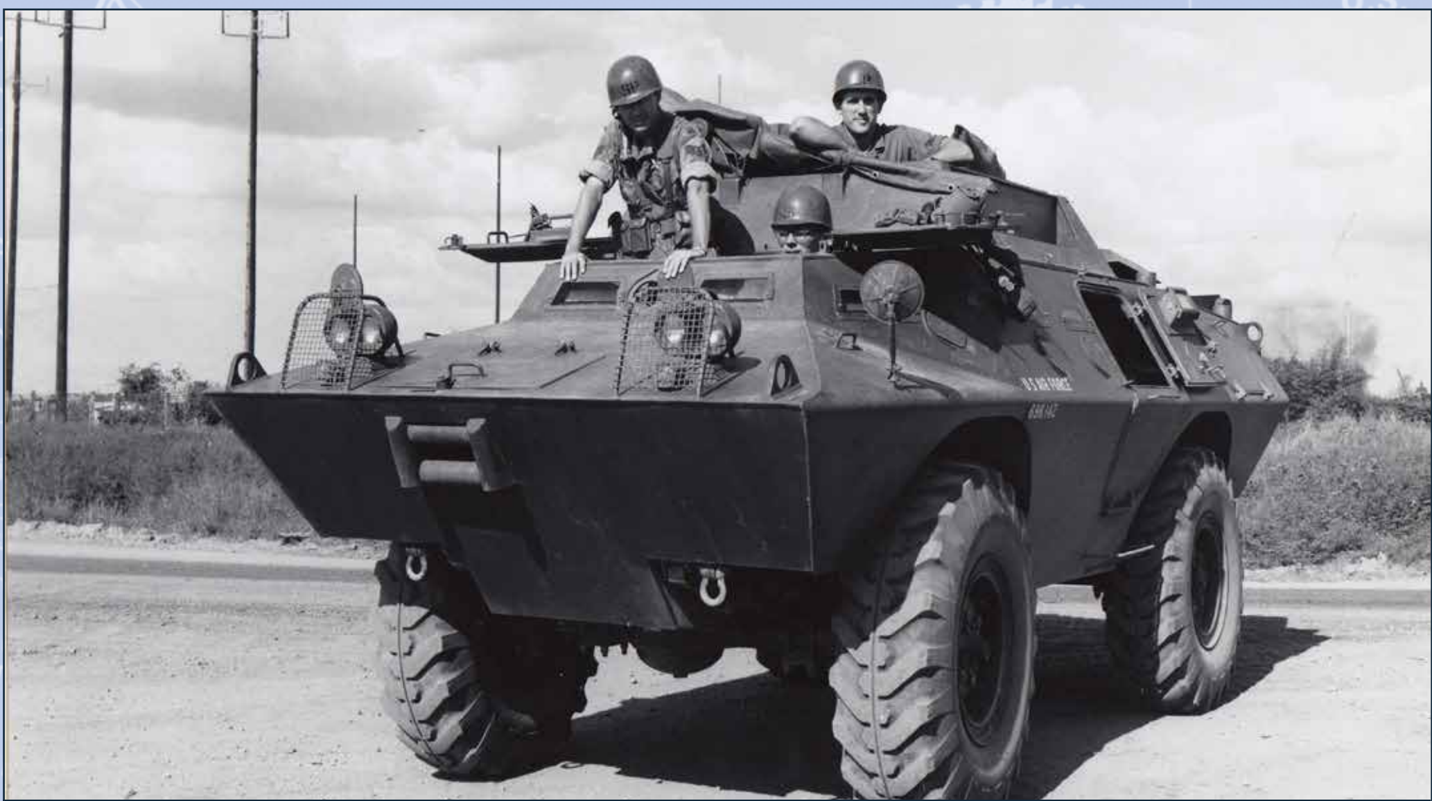
U.S. Air Force Security Police patrol the perimeter of Tan Son Nhut Air Base in an M-706 armored car. The vehicle came in three distinct marks: the V-100, the V-150, and the V-200.

They want to take out the bomb dump. Take out some of the aircraft, and that's what we were out there for, to prevent that from happening.