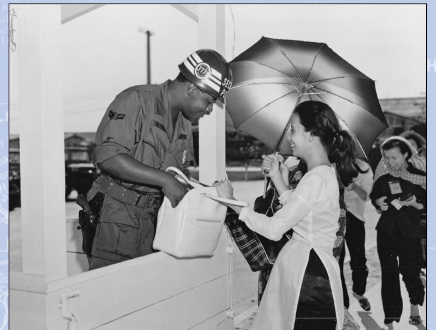
A 377th security policeman inspects the handbag of a Vietnamese civilian worker at Tan Son Nhut Air Base.

Of their chosen methods of attack, the Communists primarily relied on standoff attacks: which were long-range fires from mobile weapon emplacements. Sapper (enemy engineer) attacks were less common. Though the threat of sabotage existed, Communist forces rarely used it.