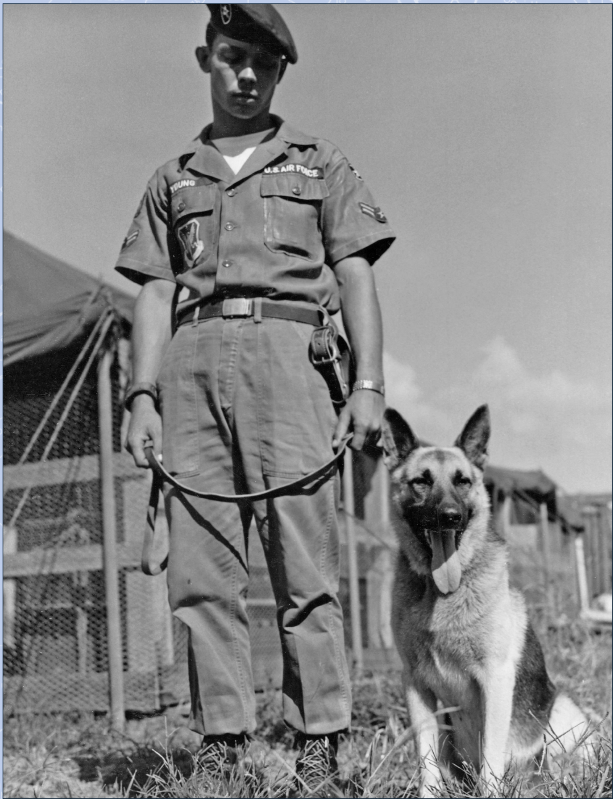
A dog handler poses for a picture prior to patrol duty. Despite efforts to reduce noise and mask their scent, North Vietnamese Army and Viet Cong troops rarely were able to fool the dogs' keen senses.