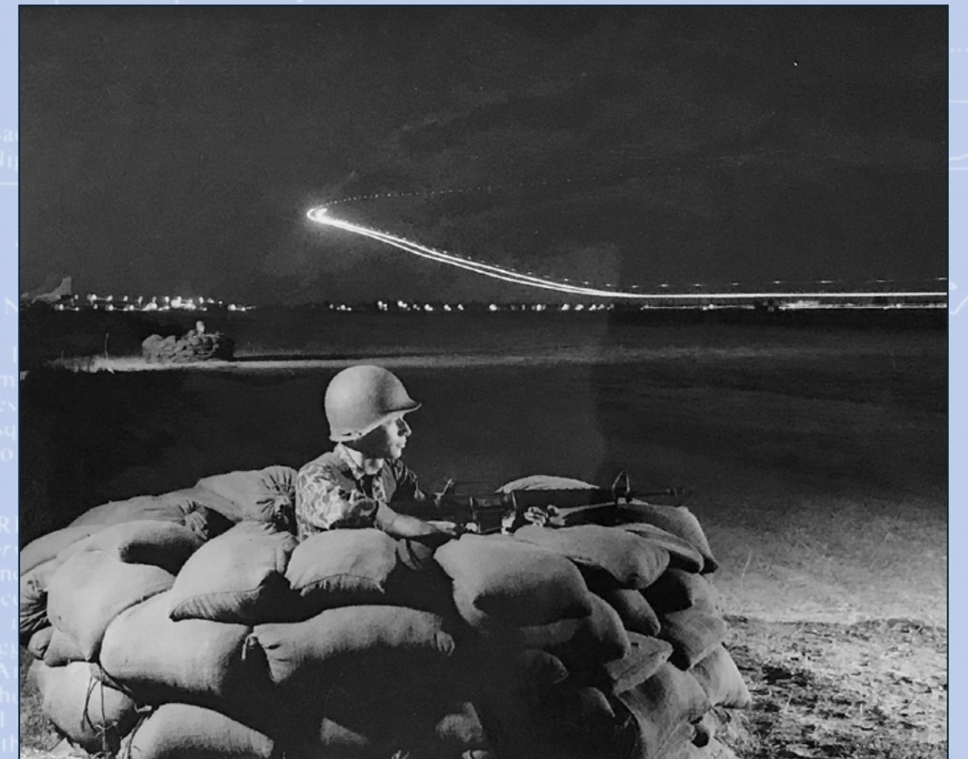
A U.S. Air Force security personnel stands night watch in a sandbag bunker.