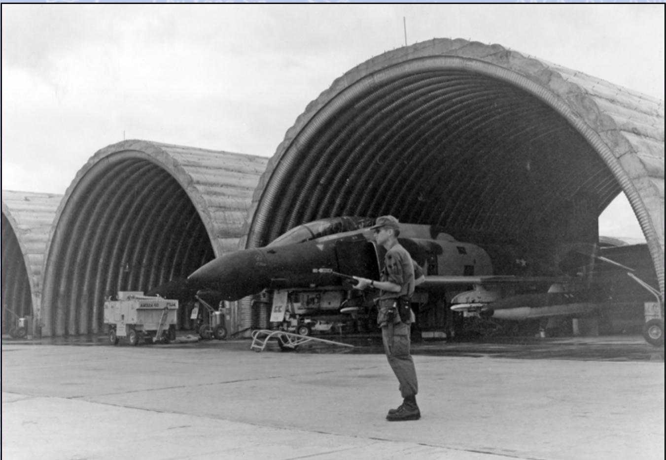
A U.S. Air Force security personnel guards an F-4 Phantom parked under a hardened aircraft shelter at Phu Cat Air Base.