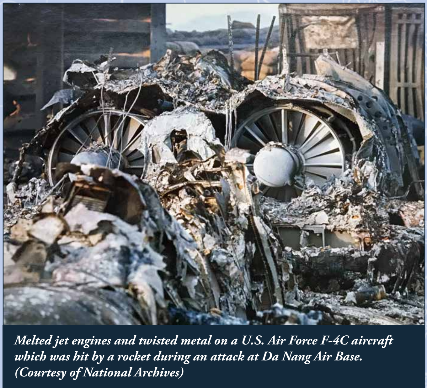
Melted jet engines and twisted metal on a U.S. Air Force F-4C aircraft which was hit by a rocket during an attack at Da Nang Air Base.

Though Communist troops typically raided U.S. air bases in small numbers, on January 31, 1968, as part of the larger Tet Offensive, Viet Cong and North Vietnamese forces launched unprecedented battalion-size attacks against Tan Son Nhut and Bien Hoa Air Bases, which were located directly north and northeast of Saigon, respectively. It is likely the attackers meant to overwhelm both air bases with sheer numbers and prevent U.S. air support from aiding beleaguered units elsewhere. Following the attacks, captured intelligence revealed units had been directed to hold until reinforced or issued further instructions. Locally, the bases' capture would have aided in toppling Saigon. More broadly, Communist control over two U.S./South Vietnamese air bases would have resulted in a tremendous loss of life, materiel, and a crippling psychological defeat.