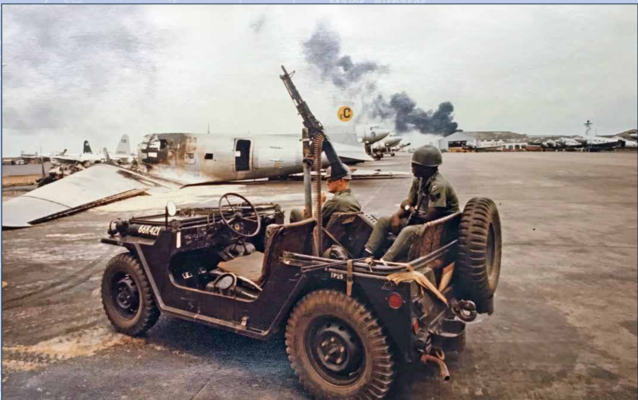
American military police stand guard in an M-151 jeep on the flight line at Tan Son Nhut Air Base following a Viet Cong mortar attack.