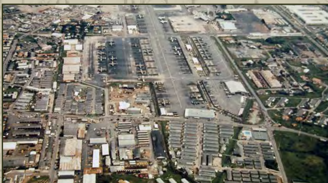
Aerial view of Tan Son Nhut Air Base, South Vietnam. This air base was utilized by Army, Air Force, Navy, and Marine Corps units throughout the Vietnam War. October 1972