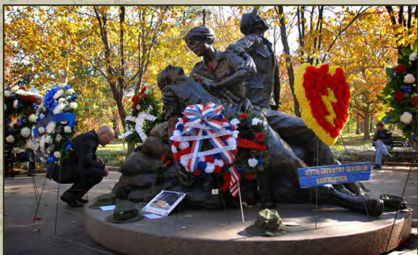
Flowers and mementos left at the Vietnam Women's Memorial in Washington, D.C. on Veterans Day, 2010.

As a result of personnel shortages, the important contributions of military women during the Vietnam War, and the transition to an all-volunteer force, more career fields and educational and leadership opportunities became available to servicewomen. Women began serving in previously restricted combat-related areas aboard surface warfare ships and in aircraft as pilots and navigators. Military accession and personnel policies regarding women also changed which opened the door for future educational and leadership opportunities. Women obtained the right to join reserve officer training programs and receive appointments to the service academies. They were also allowed to remain in the military after becoming pregnant.